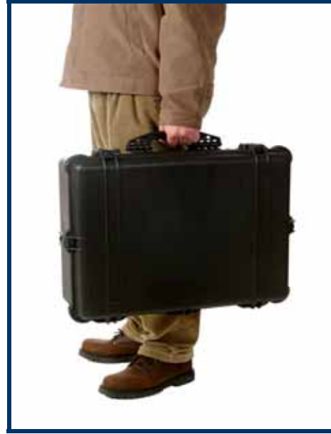
XR150 with film developing equipment in carrying case

The XR150 is a battery powered pulsed X-ray machine used for security and light industrial applications. The XR150 weighs less than five pounds, but is capable of penetrating 1/2" of steel making it an ideal tool for use in remote locations.